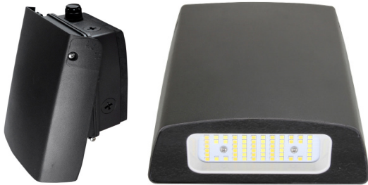
DIMENSIONS: 15W, 20W & 29W: