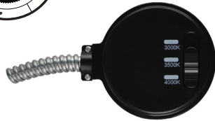
CCT SELECTION SWITCH