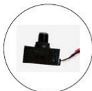
BUTTON STYLE PHOTOCELL 120-277V