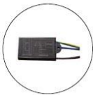
10KV SPD 120-277V