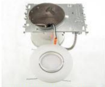
Step1: Twist adaptor into socket.