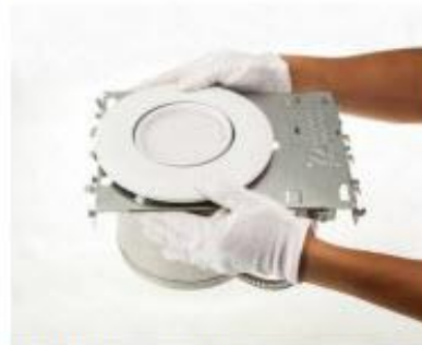
Step2: Insert male connector into female one.