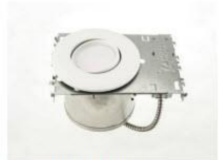
Step3: Insert LED trim.