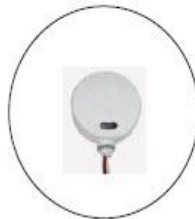
DIMMABLE MOTION SENSOR 120-277V