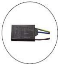
10KV SPD 120-277V