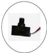
BUTTON STYLE PHOTOCELL 120-277V