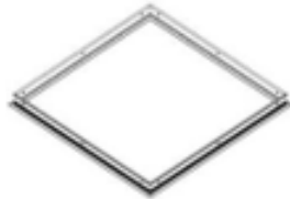
Dry wall kit