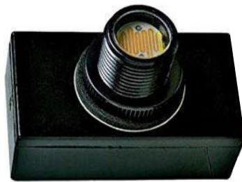
Model JL-403C (Button Type Photocell)