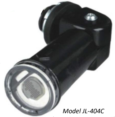
Model JL-404C (Pencil Type Photocell)