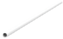
LIR-STEM*3 for LIR-24 LIR-STEM*4 for LIR-36 or LIR-48

LIR-STEM - Stem (OD 10mm, Internal thread M8) LIR-STEM-ADAPTER - Stem adapter, 4pcs per fixture LIR-SCA-S-3-(WH/BK) - Canopy for stem pendant mount for LIR-24 LIR-SCA-S-4-(WH/BK) - Canopy for stem pendant mount for LIR-36 or LIR-48