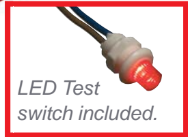
LED Test switch included.